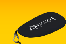
NEOPRENE COCKPIT COVERS

We offer a full line of genuine Delta accessories to complement every model of kayak we make. To learn more, visit deltakayaks.com